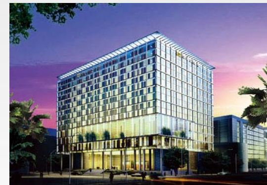
Grand Central Hotel

Address: 505 Jiujiang Road, Shanghai 200001. Tel. (86)21- 5396 5000. Fax. (86)21- 5396 5128.